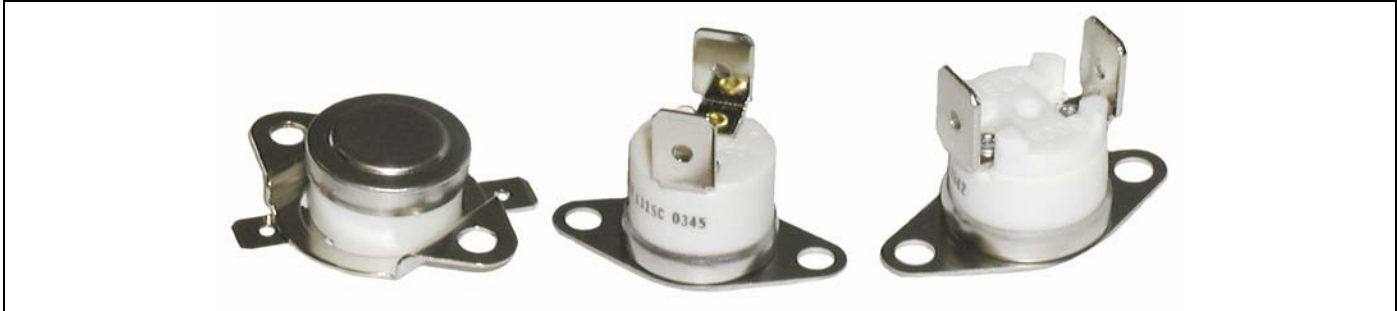
Figure 4. 2450RC/2450RCH/2455RC Series Automatic Reset Thermostat

The 2450RC/2450RCH/2455RC Series is a single pole, single throw, snap-acting, non-adjustable thermostat which may be used in applications such as industrial and electrical equipment. A temperature-sensitive bimetal disc, electrically and thermally isolated from the switch, is used to actuate the normally-closed contacts. Contacts open when surface or ambient temperatures increase to the operating set point of the calibrated metal disc. The entire switch is enclosed in a ceramic housing; the bimetal disc is retained by a metal heat-conducting end cap. Due to the small size of this unit and the inherently low mass of the bimetal snap-action disc, response of this thermostat to temperature changes is extremely rapid, compared to other commercially available thermostatic devices. For increased sensitivity, an exposed bimetal disc may be specified. A variety of mounting brackets and terminals is available.